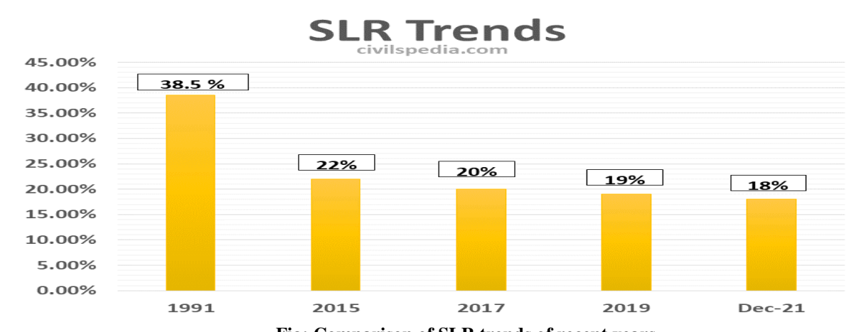
Fig: Comparison of SLR trends of recent years

The repo rate is the rate at which the Reserve Bank of India lends money to its clients in exchange for government securities. A decrease in the repo rate makes it easier for commercial banks to borrow money at a lower rate, whereas an increase in the repo rate makes it harder for commercial banks to borrow money because the rate goes up and becomes more expensive. The rate at which the RBI borrows money from commercial banks is known as the reverse repo rate. The public will be less likely to borrow money and more likely to deposit as a result of the increase in the repo rate's cost to banks of borrowing and lending. Since interest rates are high, there is less demand for credit, which reduces inflation. The repo rate and reverse repo rate are both rising as a sign that the policy is being tightened. The repo rate is 4.40 percent, and the reverse repo rate is 3.35 percent, as of May 2022.